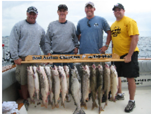
The Anderson party of Connecticut with another beautiful catch of kings and lakers.