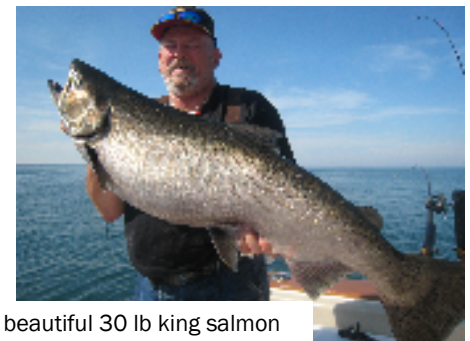
A beautiful 30 lb king salmon