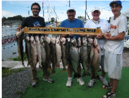
The McKeon party with a limit catch of kings and lakers taken aboard the Reel Action III.