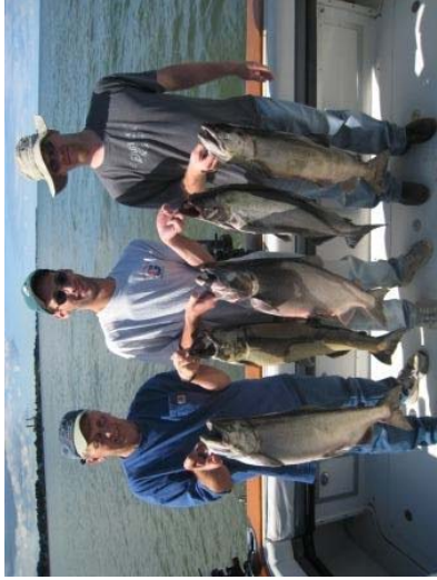
A nice catch of September king salmon taken in front of the Genesee River.